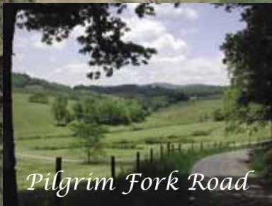
Pilgrim Fork Road