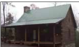
3 BR 2.75 BA Secluded Log Cabin on 2+ wooded acres. Finished basement, large rock fireplace, decorator touches, and a large workshop.....$249,000