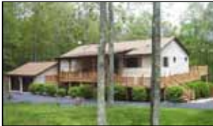
Buffalo Mtn. Road 3.7 acres with a 3/2 House and a 1/1 Cabin, income potential, excellent condition. Just off Blue Ridge Parkway. .....$279,000

Licensed in Virginia and North Carolina 1 st Time Home Buyer Credit - Don't Miss Out - Call for Details — WE SELL HUD HOMES —