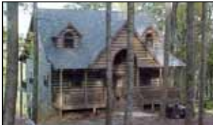
Meadows of Dan 27 Acre Private Retreat 4 Bedroom, 4.5 Bath, Family Room, Living Room, Kitchen & Dining, wonderful views of the Dan River Gorge.....$599,000