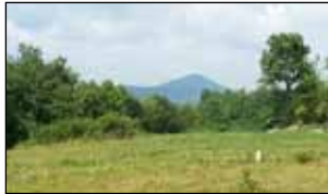
Rocky Top Lane 25 acres, very private with awesome views of Buffalo Mountain, well and septic in place. Restricted to stick built or modular.....$225,000