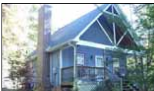
Secluded 1 BR 1.5 BA Cabin with a Cute Guest Cabin on 10 acres. Property has a storage building and a creek running through. ....$165,000