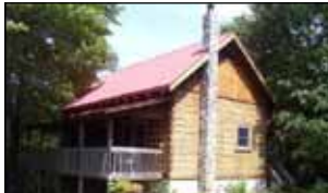
Squirrel Spur Close to the BRPKWY. Very private 2 Bedroom, 2 Bath Cabin with basement and garage on 21 Acres. Wonderful Views! .....$250,000