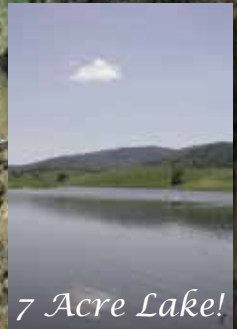
7 Acre Lake!