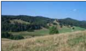
Beautiful 24+ acre tract of land with awesome views of the countryside. Walk to trout stream. More acreage available.....$146,070