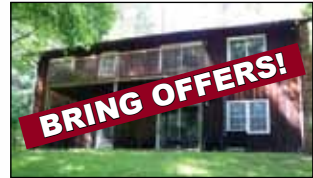
Rustic Cabin on 8 acres, 2 bedroom 2 bath, full basement (partially finished) 2 car garage, stream, pond.....$188,000