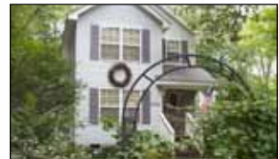
2 Bedroom, 2 Bath, just off the BRPKWY in Fancy Gap, Enclosed rock patio, sunroom, deck, additional lots available.....$174,900