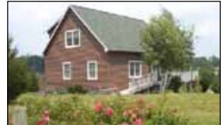
Overlook Hills Spectacular Views, 3 Bedroom, 2 Bath, just off the BRPKWY. Open Great Room, Loft, Deck. ....$209,000