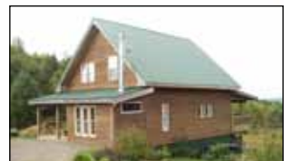
Cute log cabin in Meadows of Dan. Plenty of privacy, vaulted ceilings in the open great room. Beautiful views, close to the Blue Ridge Parkway. ....$159,000

Five Star Service is just the beginning . . .