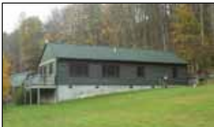
Pilot Custom Built Log Home on 18+ acres 3 BR 3 BA, Garage/Barn with additional living space on the property. Large rock fireplace, with lots of deck space. ....$465,000